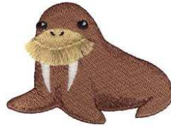
CM218_48 Walrus 3.48 X 2.60 in. 88.39 X 66.04 mm 7,840 St.