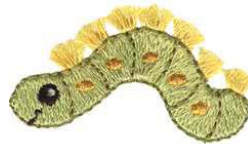
CM223_48 Caterpillar 1.95 X 1.11 in. 49.53 X 28.19 mm 2,172 St. S