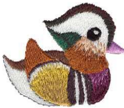
CM221_48 Duck 2.12 X 1.88 in. 53.85 X 47.75 mm 5,842 St.