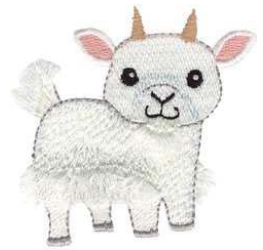
CM220_48 Goat 2.81 X 2.83 in. 71.37 X 71.88 mm 7,963 St.