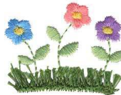
CM224_48 Flowers 1.74 X 1.36 in. 44.20 X 34.54 mm 1,672 St. ❄️ S