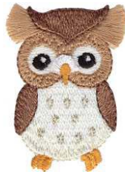
CM222_48 Owl 1.69 X 2.40 in. 42.93 X 60.96 mm 6,207 St.