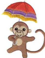
CM228_48 Monkey 2.72 X 3.68 in. 69.09 X 93.47 mm 8,527 St.