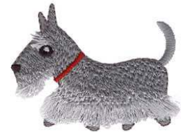
CM225_48 Scottie 2.61 X 1.98 in. 66.29 X 50.29 mm 5,722 St.