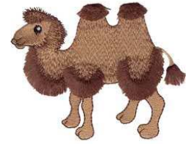
CM215_48 Camel 3.99 X 3.28 in. 101.35 X 83.31 mm 12,479 St.