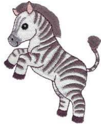
CM212_48 Zebra 2.89 X 3.76 in. 73.41 X 95.50 mm 13,669 St.