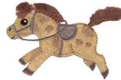
CM219_48 Pony 3.51 X 2.30 in. 89.15 X 58.42 mm 7,267 St. ❄️