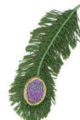
CM229_48 Peacock Feather 1.50 X 2.29 in. 38.10 X 58.17 mm 1,972 St. ❄️