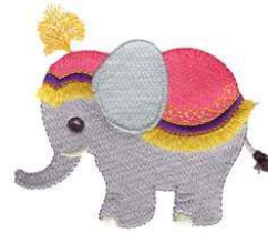
CM214_48 Elephant 4.04 X 3.59 in. 102.62 X 91.19 mm 11,829 St.