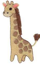
CM213_48 Giraffe 2.29 X 4.01 in. 58.17 X 101.85 mm 7,896 St.