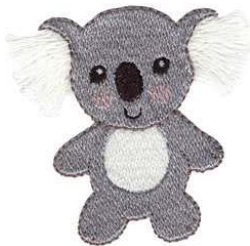
CM226_48 Koala 2.49 X 2.48 in. 63.25 X 62.99 mm 6,777 St.