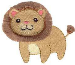
CM211_48 Lion 3.17 X 2.78 in. 80.52 X 70.61 mm 7,091 St.