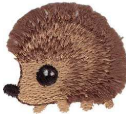
CM217_48 Hedgehog 1.58 X 1.40 in. 40.13 X 35.56 mm 3,068 St. S