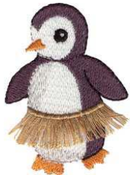
CM216_48 Hula Dancing Penguin 1.85 X 2.64 in. 46.99 X 67.06 mm 5,179 St. ❄️