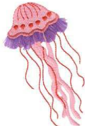
CM227_48 Jellyfish 2.60 X 3.99 in. 66.04 X 101.35 mm 5,153 St. ❄️